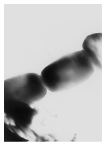
Fig. 1. Spore chains and spores of Streptomyces sp. 3B: A . Forms of the spore chains (ISP-2, 300x, 14<sup>en</sup> day); B . Spore number (ISP-3, 6000x, 14<sup>en</sup> day); C . Spore surface (ISP-3, 20000x, 21<sup>st</sup> day).