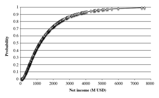
Figure 2. Cumulative distribution function: Agricultural net income.