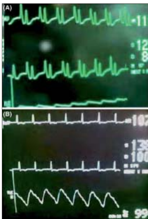
Figure 2: (A) Intraatrial ECG in lead II where P wave is larger than R wave (B) Intraatrial ECG in lead II showing a normal P wave