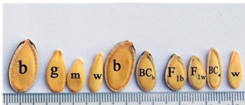
Figure 1. Parental (band w) and hybrids seeds. b: bebu, w: Wléwlé Small Seed , F_{1w} : F_1 from Wléwlé ♀ × Bebu ♂ cross, F_{1b} : F_1 from Bebu ♀ × Wléwlé ♂ cross, BC_w : back cross on WSS cultivar; BC_b : back cross on Bebu cultivar, g: recombinant form which look like “ wléwlébig seed ”, m: recombinant form which look like “ wléwlémedium seed ”