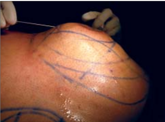
Figure 3: Infiltration of tumescent fluid

needs more than 3-5 liters of fat removal, the procedure can be repeated any time after two weeks.