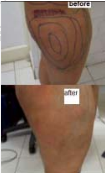
Figure 5: Liposuction results