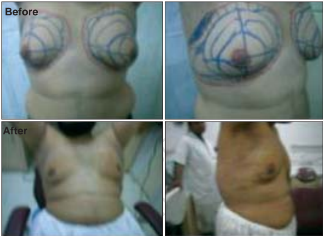
Figure 4: Liposuction results