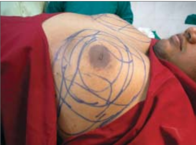
Figure 2: Topographic marking