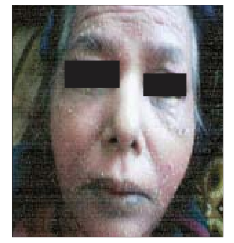
Figure 3: Exfoliative dermatitis due to NSAIDs

Other than cutaneous drug reactions, we had three cases of hemorrhagic cystitis and one case of aplastic anemia due to cyclophosphamide.