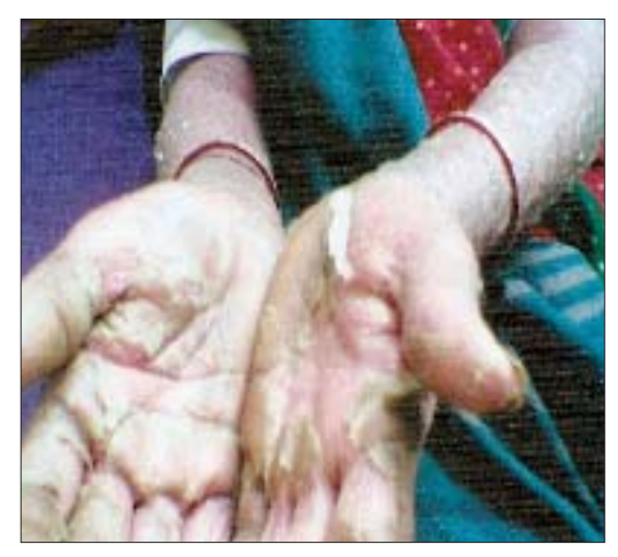
Figure 2: Exfoliative dermatitis due to NSAIDs

were managed successfully with intensive care. In addition to this, there were two cases of TEN (Toxic epidermal necrolysis), out of which one case due to rifampicin was severe but responded well to treatment and one case of TEN because of unknown drug proved fatal.