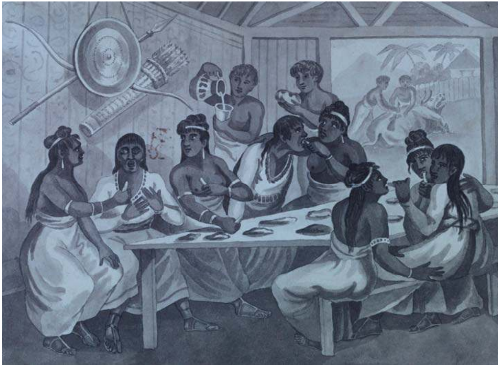
Figure 2 The Polyphemus Feast of the Abyssinians.

his travels more marvelous (Marsters, 2000). Mungo Park died in 1805 during his second expedition to Africa. He served throughout the 19 th century as an icon of the hero-explorer and as a model for many to follow. In accordance with the public image of the authors, Malthus treats Mungo Park's observations with the necessary respect and Bruce's account with a good dose of sarcasm and skepticism.