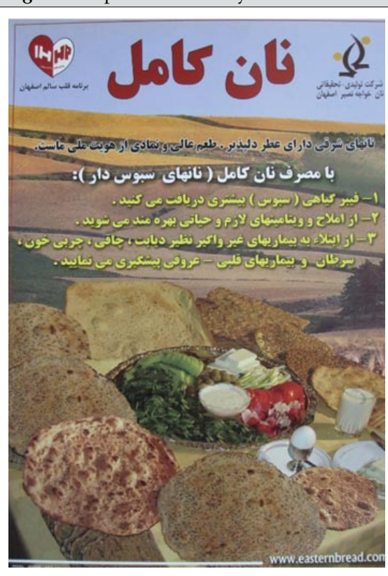
Figure 1. A poster of Healthy Bread Initiative

The opinion of people about the quality and wastage of HB and their satisfaction were assessed at the end of the study. A questionnaire was designed, and the validity of its content was confirmed by experts. Respondents were asked about three different aspects of the quality of bread, i.e. taste, brittleness, and persistence (durability). Those who reported better quality for at least 2 dimensions were assumed to believe that HB had overall better quality. The reliability of the questionnaire was