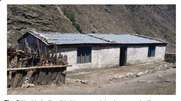
Fig. 2 Health facility (birthing centre) in the second village

Data collection included qualitative interviews with women and their family members, health service providers and stakeholders. The interviews were conducted using in-depth interview guides prepared specifically for