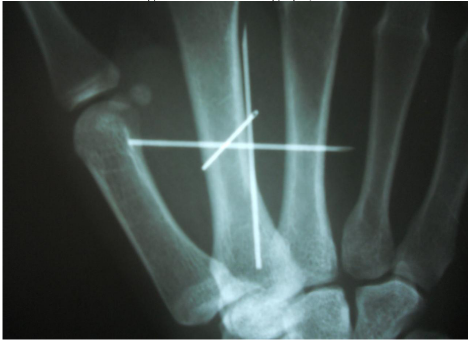
Figure 4. The control graphy AP

In the lateral graphy, the distance and orientation of the foreign body away from the skin was assessed (Figure 5).