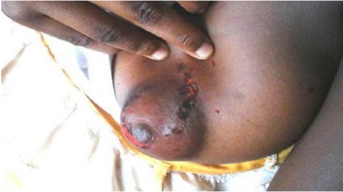
Fig. 3 Abrasion and Laceration of the breast