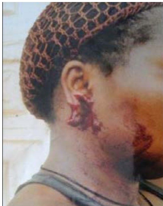
Fig. 6 Right earlobe amputation