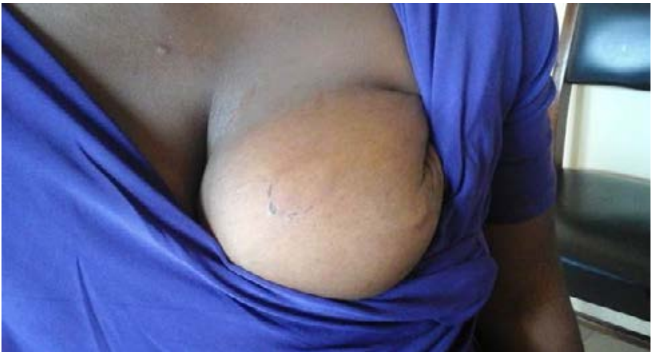
Fig. 2 Contusion of the breast

were laceration (31.0%) and abrasion (9.5%) shown in Fig. 3 (Abrasion and Laceration of the breast) and Fig. 4 Abrasion of the thigh.