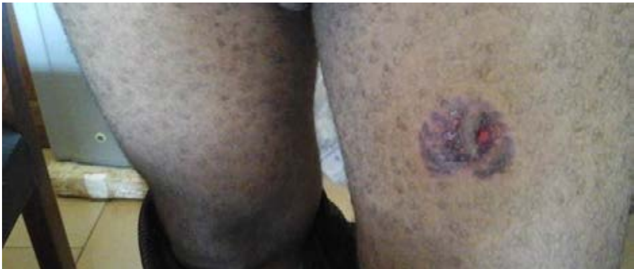
Fig. 4 Abrasion of the thigh

The rest were avulsion (7.1%) and amputation (4.8%) Fig. 5 (Upper lip amputation) and Fig. 6 (Right ear lobe amputation). Severe injuries namely laceration, avulsion and amputation occurred more in incidents involving females either as victims or as biters. The upper limbs (44.7%) were mostly affected followed by the face (29.0%). The left breast was involved twice; the right thigh twice and the scrotum once and all cases resulted from romance-related disputes. More females than males (10:1; p=0.029 )