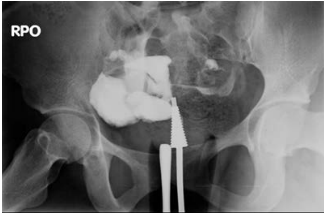
FIG 3: Hysterothrogram demonstrates normal uterine cavity with right hydrosalpinx