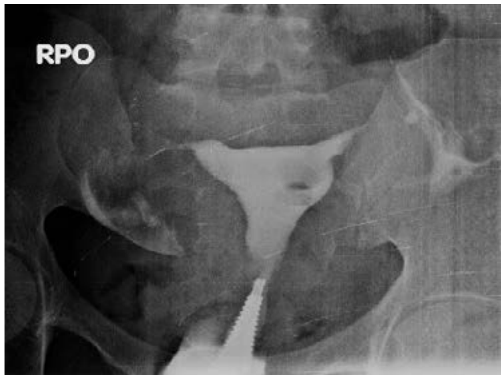
FIG 4: Hysterosalpingogram shows tubal patency with a filling defect in the uterine cavity, likely a n