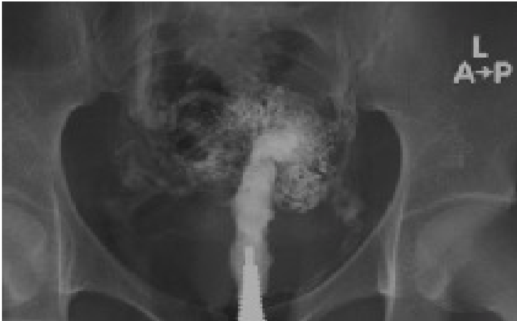
FIG 1: Hysterosalpingogram demonstrates a small and conical uterine cavity with extravasation on further contrast of contrast - Asherman's

The proportion of dye spillage in those with uterine masses, hydrosalpinx and other abnormal findings are also outlined in table 1. Statistically significant findings ( p < 0.01 ) were seen as follows: clients with normal and large uterine cavities had a higher percentage of spillage or tubal patency. (fig. 4). Clients with Asherman's disease, cervical stenosis and adhesions had less percentage of tubal spillage than those without.