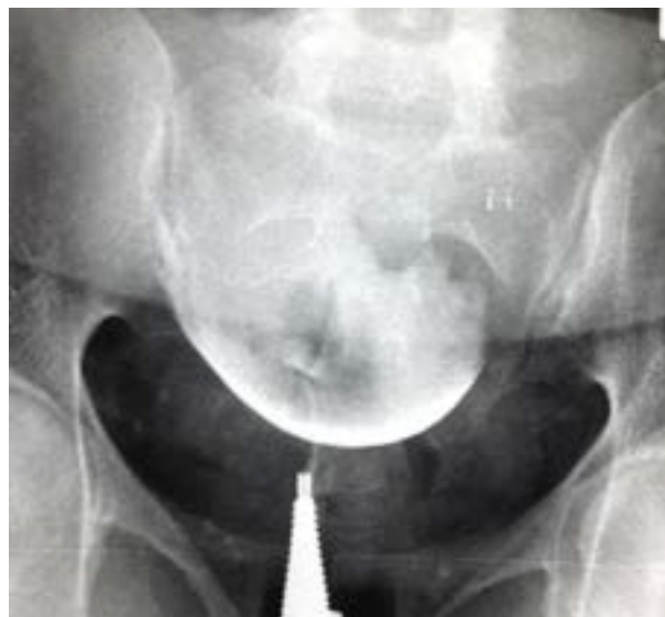
Fig 2: hysteroqram showing a grossly enlarged uterine cavity with a large filling defect/mass – Submucosal myoma. The tubes are not outlined

Figure 5 shows the distribution of abnormal findings in the study. Tubal pathologies were the most common abnormality in this study, constituting 35.1% of the cases. The tubal abnormalities comprised of tubal blockage, absence and hydrosalpinges, followed by uterine masses seen in 223 (22.9%) of the clients. Bilateral tubal blockage was seen in 106 (10.6%). The least was uterine malformations such as septate and arcuate uterus in 1 (0.1%) each.