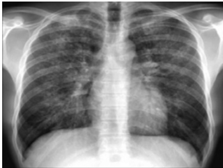
Figure 1: Typical chest X-ray of Pneumocystis jirovecii pneumonia in an HIV-infected patient. The X-ray shows ground-glass opacities, diffuse patchy infiltrates and pneumatoceles (arrows). 21

Although the findings are similar, ground-glass opacities may be more extensive and spread more rapidly, with-