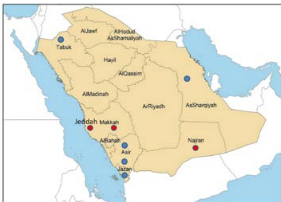
Fig. 1 Regions in the Kingdom of Saudi Arabia, where people were infected with Alkhurma Hemorrhagic Fever Virus (AHFV). Red circles designate the areas with confirmed AHFV cases, while blue circles designate the areas of serologically positive individuals 17 .

Alkhurma hemorrhagic fever virus (AHFV) was initially isolated from a butcher in the year of 1995, who slaughtered a sheep in the Alkhurma region and was admitted at Soliman Fakeeh Hospital, with hysterical symptoms of fatal hemorrhagic fever 3 . Accordingly, the name 'Alkhurma' was later approved by the International Committee for Taxonomy of Viruses, relating the nomenclature of this virus to the village 'Alkhurma' in the Kingdom of Saudi Arabia 4 . Subsequently, many new cases followed in the KSA, with similar symptoms and clinical manifestation 5 . It is worth noting that the national epidemiology of the AHFV is yet to be uncovered in this country 4 . Fig. 1 showed the areas in KSA that were affected by AHFV; this Figure was constructed based on the limited targeted surveillance, in which the confirmed cases in regions affected by AHFV are highlighted in red colour, while the possible diagnosis, based only on positive serology of investigated cases, are highlighted in blue.