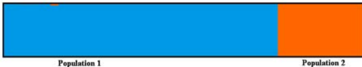
Fig. 2 Bayesian cluster analysis using the STRUCTURE program: results for K = 2 . Graphical representation of the dataset for the most likely K ( K = 2 ), where each colour corresponds to a suggested cluster.