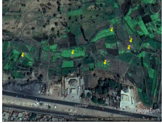
Plate 1: Vegetables sampling locations near Jimeta city solid waste dumpsites

Sample Treatment and Analysis: Two hundred grams (200g) of the vegetable samples collected were thoroughly washed with fresh water in order to remove the adhering dirt and finally with distilled water. The vegetable samples were cut into pieces and air-dried, then placed in an electric oven at 65°C to remove all the moisture. The dried vegetables samples were homogenized by grinding using an electric blender to obtain a homogenous mass for subsequent analysis. (Chailapakul et al., 2007 and Wuana et al., 2011). To determine the concentration of heavy metals in vegetable samples, aliquot (about 0.3 g) amount of the ground dried samples was taken in a vessel of the microwave oven and 4 ml of concentrated nitric acid (HNO<sub>3</sub>) was poured. After the digestion, the samples were filtered and leveled up to the mark with distilled water in a 10 ml volumetric flask. Finally, the samples were analyzed for heavy metals using Atomic Absorption Spectrophotometer (Air Acetylene flame intergraded mode, Buck 210VGP) (Gupta et al., 2008; Khan et al., 2008).