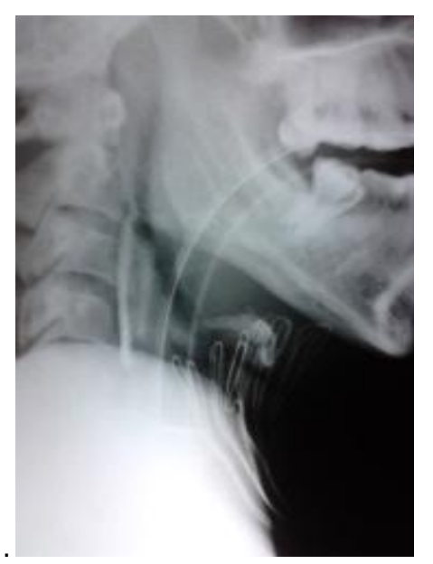
Figure 1. Preoperative X-ray Showing the Foreign Body and Endotracheal Tube

Though the patient was haemodynamically stable with only mild signs of respiratory distress, because of the mechanism of the injury and the multiple injury points, we decided to perform a computed tomographic angiography (CTA) to rule out any vascular or aerodigestive tract injuries. This revealed no vascular injury but 3 bullet pellets were noticed in the right side of the neck and there was a comminuted fracture of the lower edge of left mandible medially spilling multiple fragments of the bone in the floor of mouth, and elevating the floor of the mouth. There was also a comminuted fracture of the hyoid bone and midline fracture of the thyroid cartilage with its right ala displaced medially, partially blocking the laryngeal vestibule. The CTA also revealed extensive soft tissue emphysema of neck and superior mediastinum. All major blood vessels and trachea were intact.