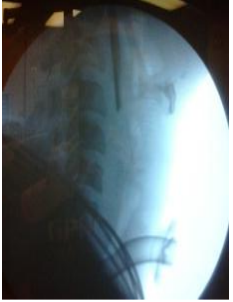
Fi Figure 2. Post Laryngeal Repair Xray-still Showing the Foreign Body