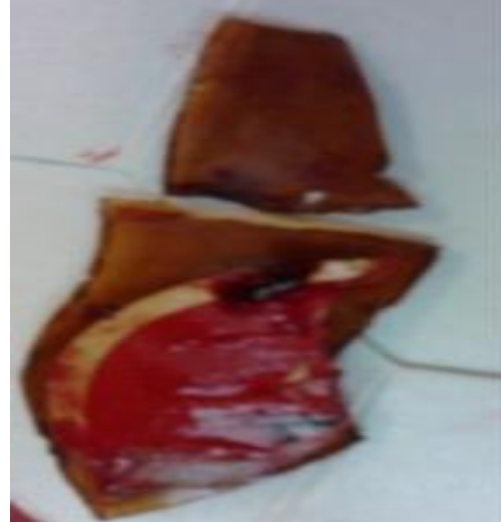
Figure 3. Broken Bottle Glass Pieces with Brand Label Still Intact