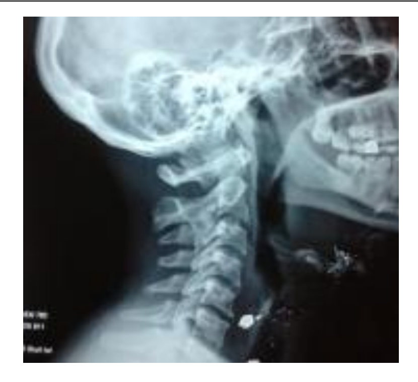
Figure 8. Check X-ray 3 Weeks after Surgery