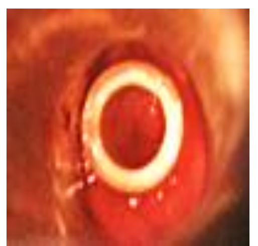
Figure 4. Improvised laryngeal stent insitu