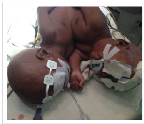
Figure 3. Both babies intubated and monitors positioned.

Intravenous fluids, blood loss and urine were calculated hourly to keep up with fluid balance. Monitoring consisted of pulse oximetry, non-invasive blood pressure, electrocardiogram, core temperature, BiSpectral Index, end-tidal carbon dioxide. Sevoflurane was monitored for both inspired and expired gas fraction and minimum alveolar concentration (MAC).