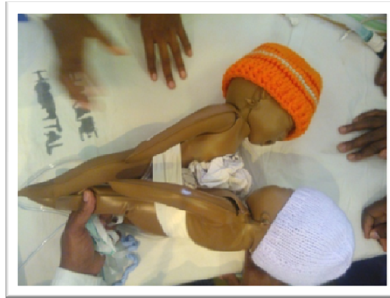
Figure 2. Use of manikins for practice drill-runs. The team responsible for each baby was identified by the colour of the baby's hat, and wore a similar colour hat

The initial anaesthetic assessment of the twins for separation was at six weeks when their joint weight was 6.4kgs. Laboratory results were almost the same for each twin for full blood count and electrolytes. The larger twin [Twin B] appeared easier to intubate, and could adequately laterally rotate his head for a laryngoscopy to be performed with ease. The area of abdominal wall attachment was large, which raised concerns about potential blood loss and respiratory embarrassment post-operatively. The twins had good veins, leaving the option of inhalation or intravenous induction open. The extent of cross-circulation was unquantified, also raising concerns about anaesthetic drugs crossing from one twin to the other especially at induction since this was going to be done sequentially. This could be a potential problem at separation. If one twin was dependant on the anaesthetic crossing from the other twin to achieve a suitable depth of anaesthesia, separation would then expose that twin to risk of lightening anaesthesia and waking up.