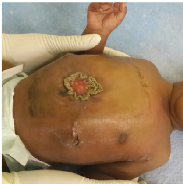
Figure 5. At Follow up, defect almost closed.