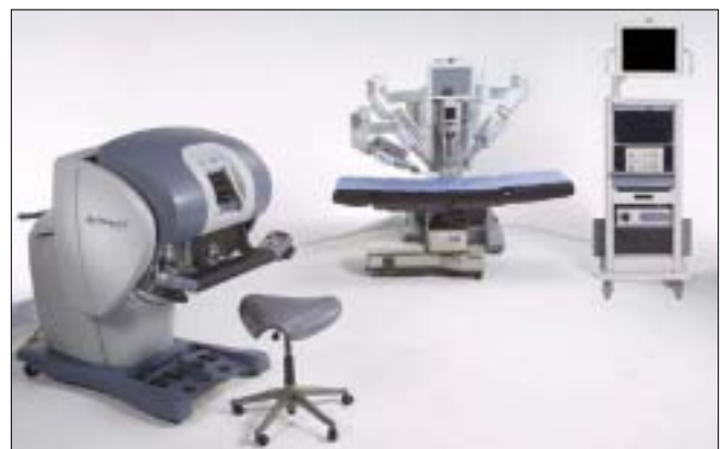
Figure 1: da Vinci S-Type (Intuitive Surgical Inc., Sunnyvale, CA)

Each arm has a series of multiple positioning joints and a terminal pivot joint at the attachment with the port allowing easy positioning of the arms during setup and a full range of movement during the surgery. Buttons provided at each joint allow manual adjustment by acting as a clutch, releasing the button locks the arm in place. The central, camera arm is compatible with a standard 12-mm port and the camera unit. The other three arms attach to specially designed 8-mm metal ports supplied with both blunt and sharp trocars. The arms are mechanically and electronically balanced for safety and ease of use. Custom-fitted plastic drapes are available to drape the four arms to achieve sterility, thus, allowing only the sterile ports and instruments in the operating field. The camera system (Insite vision system, Intuitive Surgical Inc.) has a dual lens system with two three-chip cameras and spatially separated within 12-mm casing. Hence, two complete optical systems are incorporated, representing the left and right eyes. The spatial separation of these images projected to the surgeon's eyes in the binocular viewer allows true 3-D image perception at the console. The head end of the cart is fitted with a HD monitor for the benefit of the assistant surgeon and the scrub nurse.