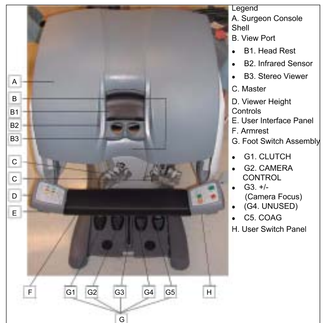
Figure 4: Surgeon console