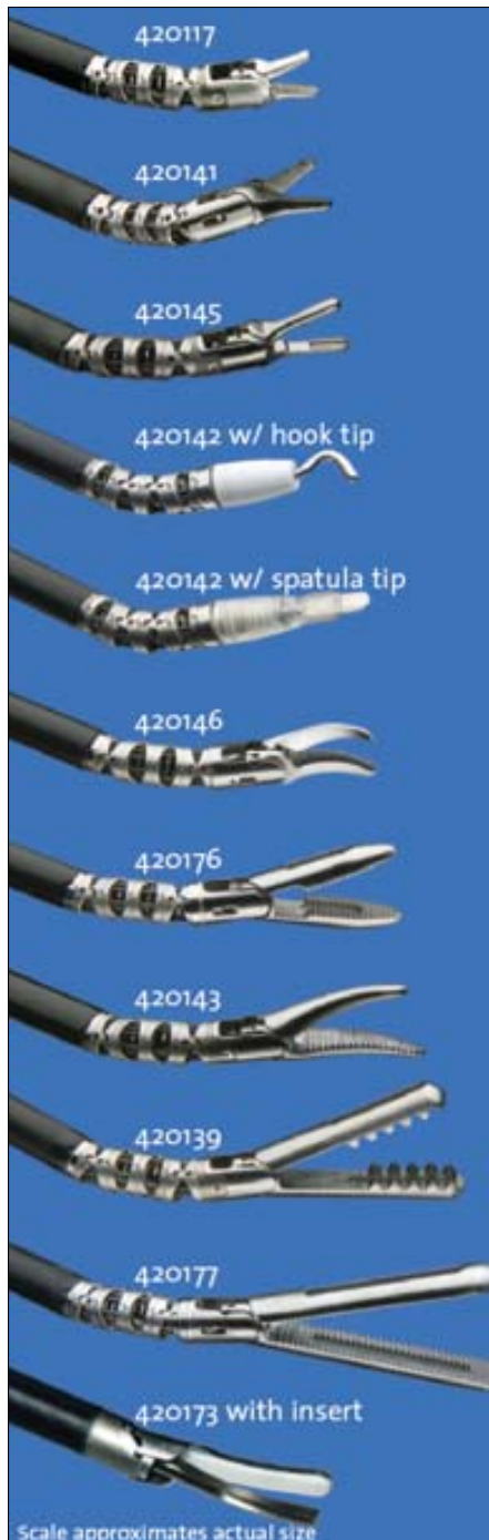
Figure 2: Instruments

the human wrist [Figure 3]. The human tremors are effectively abolished by position sensing, which occurs approximately 1500 times per second. There are six degrees of motion at the instrument tip and a seventh degree of freedom provided by the instrument itself (e.g. grasping or cutting). Each instrument has only 10 lives