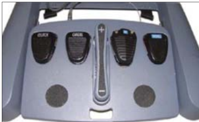
Figure 7: Foot control