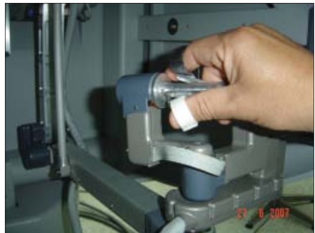
Figure 6: Masters