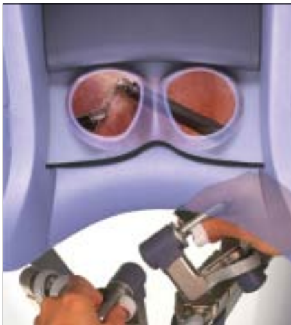
Figure 5: Binocular viewer

There are five foot pedals. Starting from the left, the clutch pedal simply disengages the instruments from