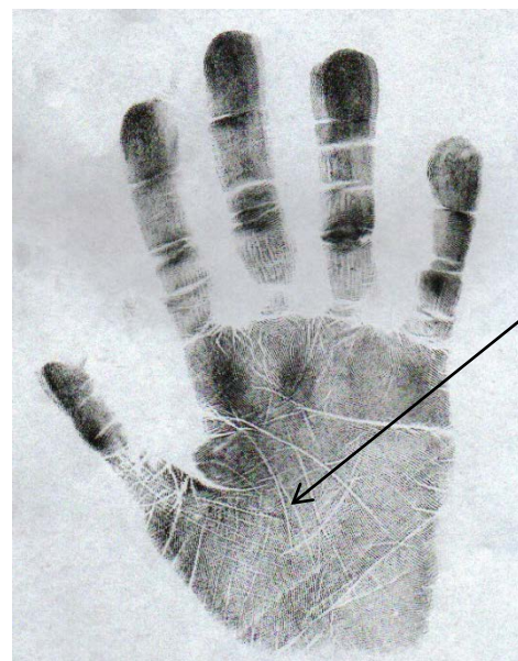
Fig. 3 Showing Lines A, B, C, D with extra line on thenar eminence