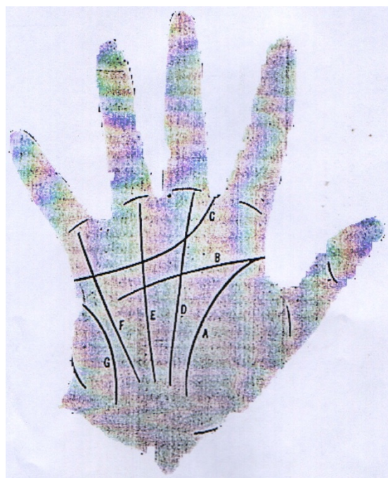
Fig 1 Schematic representation of Milton classification of palmar flexion creases

Right and left palmar and digital prints were obtained by ink procedure (Antonuk, 1970). The prints were obtained on A4 plain papers, already marked right and left, and spaces provided for biographic information.