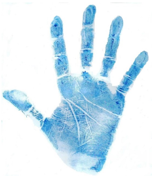
Fig. 5 Lines A, B, C, D arranged in letter 'M'