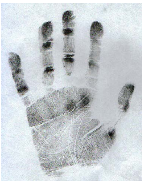
Fig. 4 Lines A, B, C, D with cascades