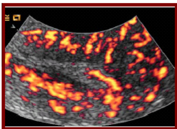
Figure 2 Endometrial vascular pattern (B).