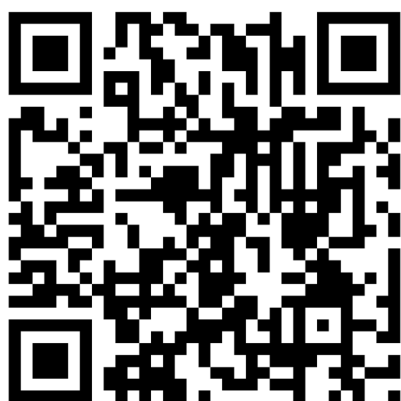
Figure 3: Malaysian Journal of Medical Sciences Quick Response Code.

To enhance the quality and quantity of publications, especially among developing countries, a “challenge” was submitted on the Scientists Without Borders website at the end of 2010. We are pleased to have received good responses from scientists of various fields who volunteered to review and edit for MJMS . We would like to express our sincere gratitude to our reviewers and editors for their contributions.