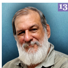
Figure 13: Visiting Professor Pedro Valdes Sosa from the Cuban Neuroscience Center.