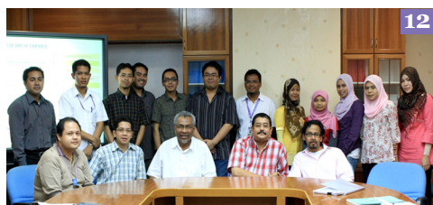
Figure 12: Trainee neuroscience lecturers from the Department of Neurosciences as well as the School of Medical Sciences meeting on the 24th October 2009 to decide on their PhD tracks and specialisations.

The fate of Brain, Mind and Neuro sciences within Asia (9–12) depends on China, Japan, India and South Korea leading, and Singapore and Malaysia following. The neuroscience innovators from the different universities in Asia will soon be the biggest contributor to biotechnology and industrial growth in Asia. It will require much collaboration and strong fundamental knowledge to match the Human Brain Project (13) as well as USA's Brain Research through Advancing Innovative Neurotechnologies (14). I hope that the recent launching of the Neuroscience center will lead to excellent growth in the field of research in the brain and neuro sciences (Figure 16a,b,c).