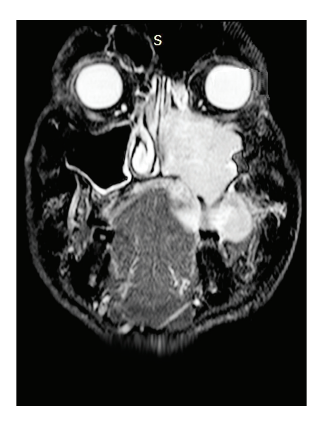
Figure 2: Axial MRI of the lesion showing a large invasive sinonasal mass centred in the left maxillary antrum.

maxillary antrum was found to cause prominent osseous destruction. A massive inferior extension of the tumor was determined through the destruction of the floor of the maxillary antrum and left hard palate. Compression of the left posterior tongue from above, with tumor infiltration of the left buccal space, was observed. Medially, no tumoural extension across the midline to the right side was found. Superiorly, scalloping of the floor of the left orbital, without direct intraorbital tumor invasion, was observed (Figure 2). No metastatic lymph nodes were identified in the imaging. Radiological differential diagnoses were squamous cell carcinoma, adenoid cystic carcinoma, mucoepidermoid carcinoma, or undifferentiated malignant lesion of the left maxillary sinus.