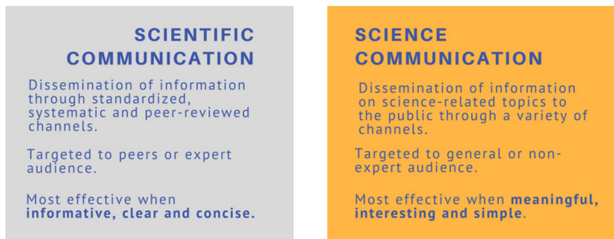
Figure 2. Comparison of scientific communication and science communication

Confusing science communication as “dumbing it down” is erroneous and such presumptions of superiority only sustain the gap between scientists and everyone else. The act of simplifying complex ideas and presenting them in engaging language that speaks to everyone requires a fundamental and philosophical