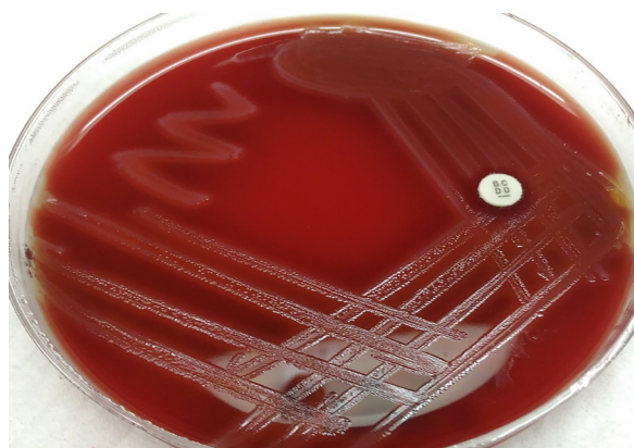
Figure 2. Appearance of Streptococcus pyogenes produces a zone of \beta hemolytic around the colonies and it is sensitive to bacitracin disc on the blood agar, following 24 h of incubation under anaerobic conditions

that weaken the immune system, such as diabetes, organ transplant, chemotherapy, and AIDS (38). All racial and ethnic groups are affected by pharyngotonsillitis worldwide and the infection can affect both male and female genders (39).