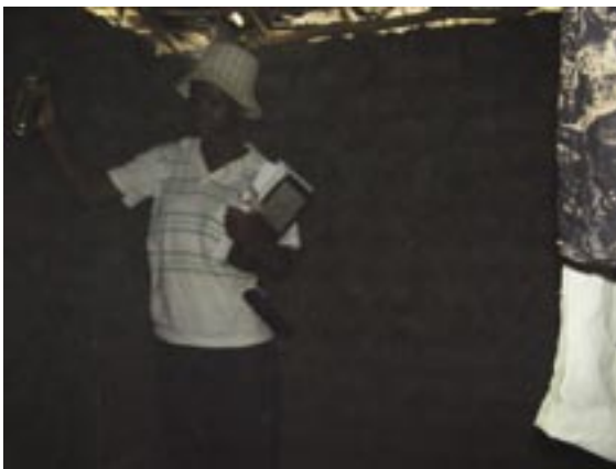
Figure 3 Pyrethroid Knock down Spraying