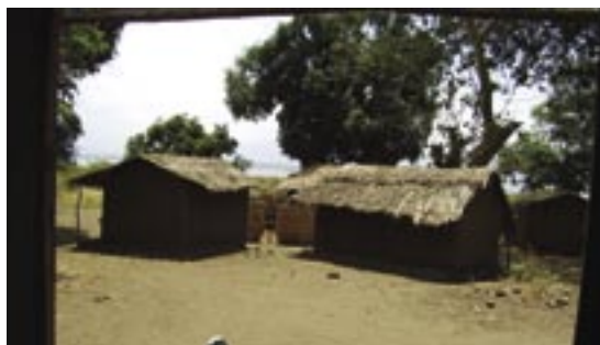
Figure 1a and 1b The mud huts of Chisi Island enrolled in the study.