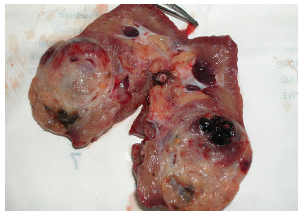
Figure 2. Operative specimen showing well demarcated tumour in the lower pole of the kidney