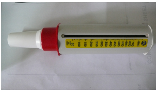
Figure 1. Peak Expiratory Flow Rate (PEFR) meter