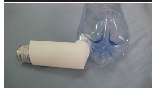
Figure 2. ‘Spacer’ made from a water or Sobo bottle

To sidestep the issue of inhaler technique, patients using a salbutamol inhaler should be taught to use a spacer device. This allows the patient to inhale the salbutamol with little need for co-ordination. They simply dispense the inhaler into one end of the ‘spacer’ and breathe normally from the other. It is possible to buy a spacer device, but it is also possible to make one yourself from a plastic water bottle (Figure 2)