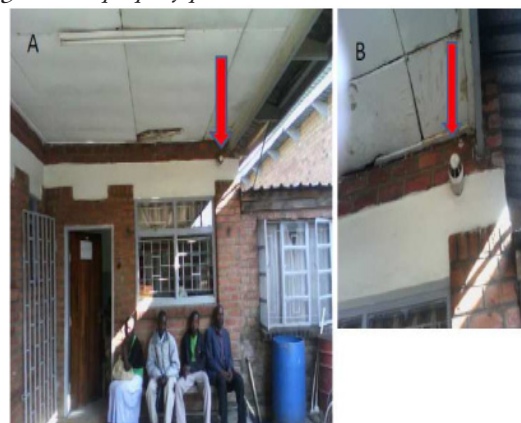
Figure 2: Improperly placed exhaust ducts at Limbe Health Centre.

At Lirangwe Health Centre, there was no electricity