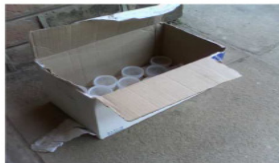
Figure 1: Improvised transportation boxes

Chileka Health Centre had no disinfectants. The already prepared reagents were not properly labeled. And the biosafety cabinet was not working properly.