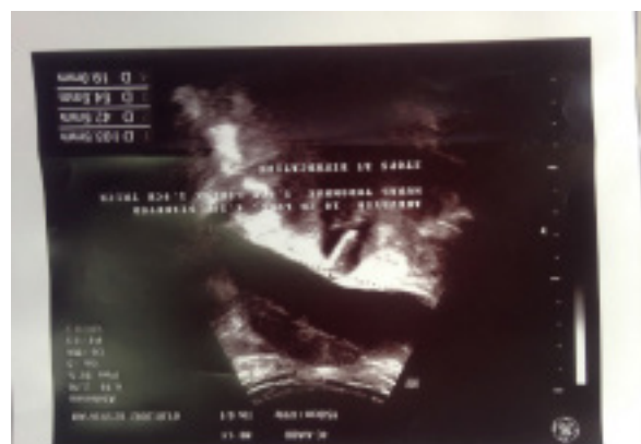
Figure 1: Aneurysm dimensions

removed which was later confirmed histologically to be an organising haematoma. Both common iliac arteries showed no aneurysmal changes and were flushed with normal saline. A 26mm straight woven Dacron graft was then inserted and sutured infra-renally. Aneurysm sac was then sutured over the graft with no leaks. After 1 day of intensive care unit stay, she was moved to the general ward. Repeated imaging of the aorta was unremarkable. She was discharged on the seventh postoperative day and follow up at three months was unremarkable.