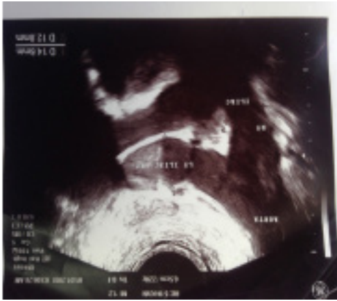
Figure 3: Common Illiac arteries spared