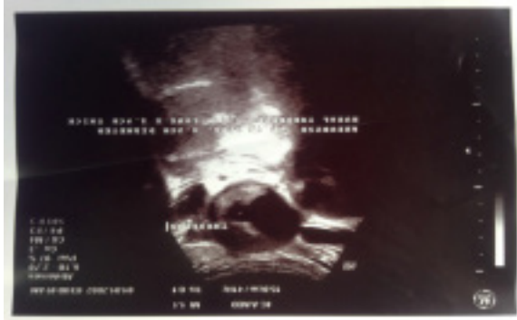
Figure 4: Mural thrombus eccentric to the left