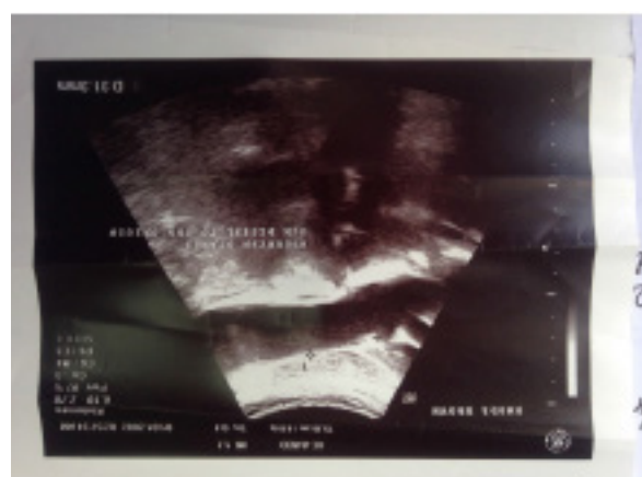
Figure 2: Aneurysm origin