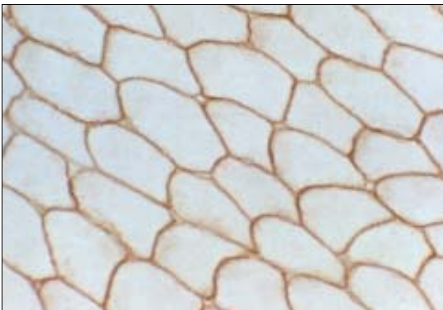
Figure 3A: Normal dystrophin immunostaining of muscle