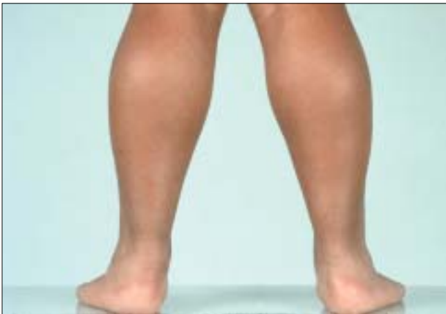
Figure 1: Calf hypertrophy in a boy with DMD

Symptomatic management and surveillance of the orthopedic, cardiac and respiratory complications associated with DMD allows anticipation, early detection and treatment of these complications.