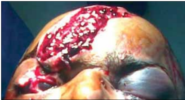
Figure 1: Clinical photograph showing lacerated wound extending from right supraorbital margin to right parietal region with herniation of the brain tissue with right eye globe rupture