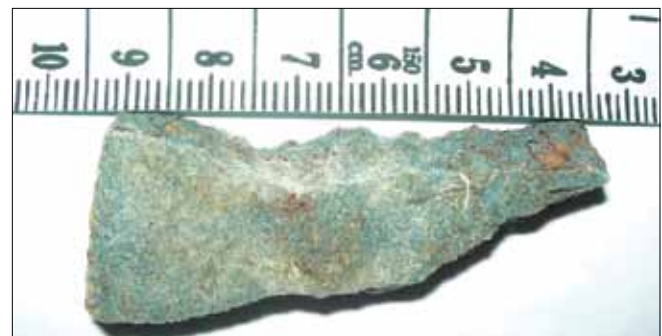
Figure 4: Figure showing extracted foreign body (ceramic stone)

prescribed decongestants (mannitol, frusemide) along with antiepileptic (phenytoin) and antibiotics during the postoperative period. He was electively ventilated for 72 hours, gradually weaned off, and extubated. The intracranial pressure (ICP) was monitored in the postoperative period for three days and was within normal limits. Postoperative course was uneventful and the patient was discharged on postoperative day 11. At the time of discharge, the patient's neurological response was E3V2M5 (GCS = 10). The patient recovered in due course of time and recovered to GCS of 15 at six-month follow-up visit.