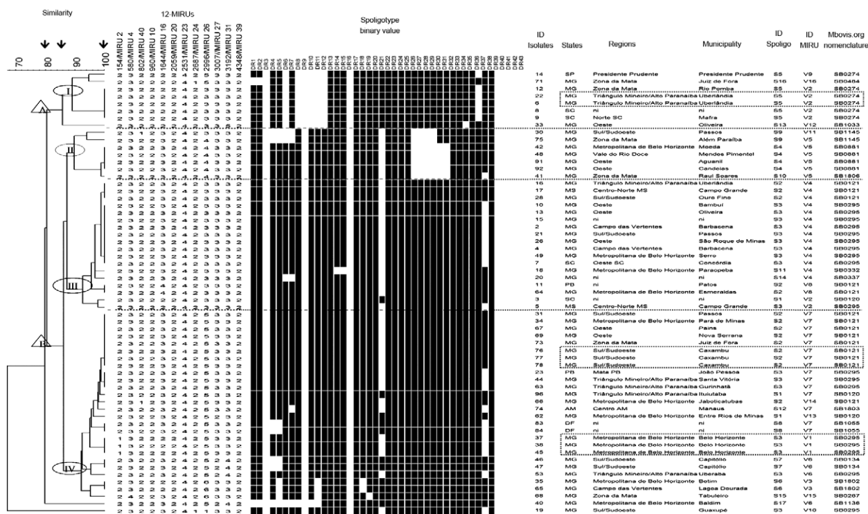
Fig. 2: the dendrogram was constructed based on simultaneous analysis of spoligotypes and MIRU-VNTR genotypes using the categorical index and unweighted pair-grouping method analysis algorithm. Arrows indicate the similarity indices evaluated. Ellipses and triangles demarcate groups formed by the cut-offs 85% and 80%, respectively. Dashed squares designate isolates with possible epidemiological links.

Many reports on the MIRU-VNTR genotyping of M. bovis isolates tested other sets of tandem repeat loci , such as the ETRs (ETR A-F) (Frothingham & Meeker-O'Connell 1998) or the Queen's University Belfast VNTRs (Skuce et al. 2002), demonstrating an increasing discriminatory power in the case of M. bovis isolates, either epidemiologically related or not (Roring et al. 2002, Allix et al. 2006, Boniotti et al. 2009, Duarte et al. 2010). According to Roring et al. (2004), although some individual loci have a high discriminatory power for both M. tuberculosis and M. bovis isolates, others seem to be more polymorphic for a particular species and thus, in general, fewer polymorphisms are observed in M. bovis isolates. In addition, regional differences in the discriminatory power of genetic markers make it necessary to define an optimal combination of genotyping markers to