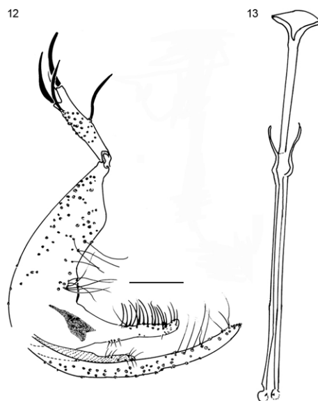
Figs 12, 13: Evandromyia ( Aldamyia ) apurinan sp. nov. Holotype male: 12: terminalia; 13: ejaculatory ducts. Bar = 100 \mu m.