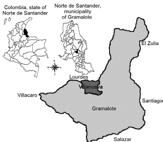
Fig. 1: study area: Villanueva, municipality of Gramalote, Norte de Santander, Colombia.

The frequency of Pi. spinicrassa collected with protected human bait was higher in the peridomicile area than in the intradomicile area ( p < 0.003 ), whereas the highest frequencies found for the automatic light trap (CDC) collections were observed in the intradomicile area ( p < 0.014 ). The highest Williams' average (11.5 insects/trap) was obtained for the forest, followed by the