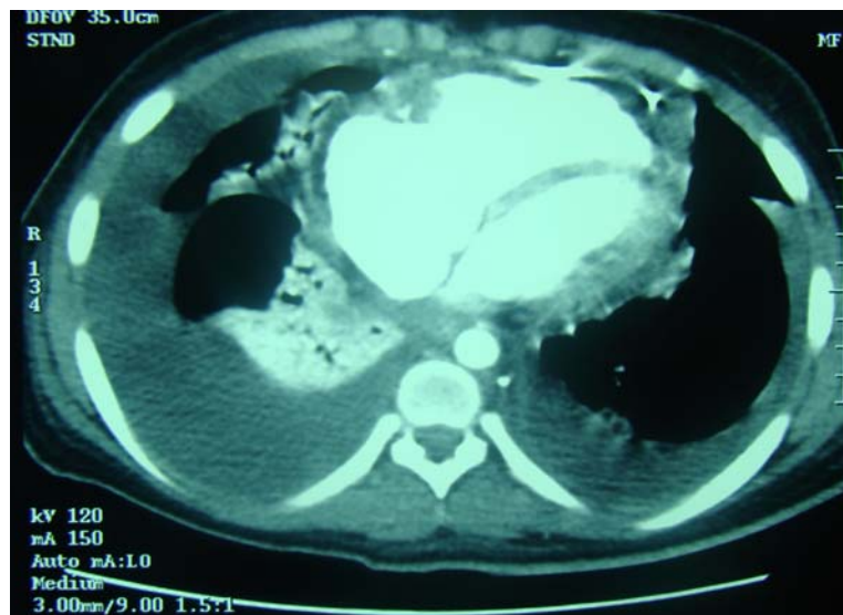
Fig. 1: Chest CT scan with contrast revealed large amount of pericardial effusion and anterior mediastinal mass

adhesion to the aorta, very thick pericardium and inflammation between the pericardium and myocardium and two large right atrial masses (6.2, 2.5 cm) were seen. Surgical excision of the mediastinal and right atrial masses was performed and epicardial temporary pace was fixed for prevention of arrhythmia and sudden death.