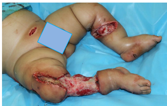
Fig. 4: Healthy granulation tissue of the debrided wound before proceeding with the reconstruction

Key words: Necrotizing Fasciitis; Abdominal Compartment Syndrome; Negative-Pressure Wound Therapy; Infant