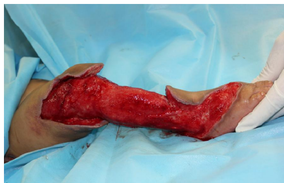
Fig. 2: The defect following surgical debridement. It was not suitable for immediate closure with flap or skin graft

Abdominal ultrasound revealed gas accumulation in the gastrointestinal tract and minimum fluid. Meanwhile following hospitalization, erythema and swelling of the legs was found to be rapidly progressing (Fig. 1). Fasciectomy and extensive surgical debridement of the two legs, hypogastrium and bilateral iliac regions was performed immediately and hand-made NPWT was applied simultaneously (Fig. 2). Pressure was applied at -50 mmHg continuously for the duration of therapy.