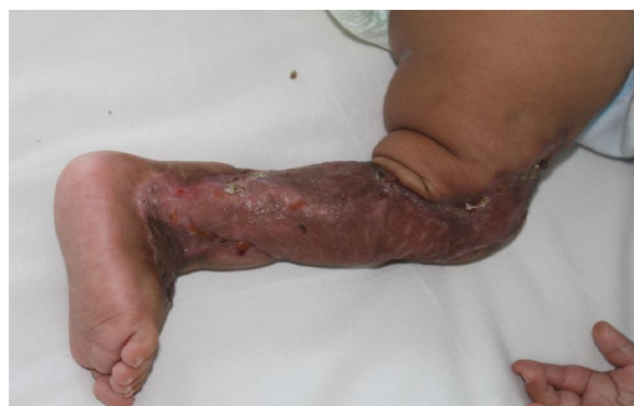
Fig 5. One month following placement of meshed split-thickness skin graft on the right leg