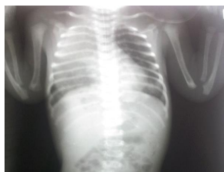
Fig. 2: Chest X-ray after treatment for 1 week