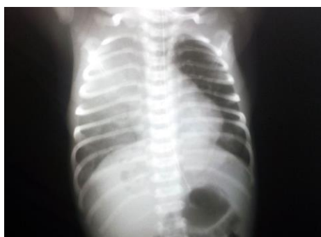
Fig. 1: Chest X-ray at admission

Neuroblastoma is characterized with densely cellular, primitive, "small blue-cell tumor" appearance. Undifferentiated neuroblastoma may