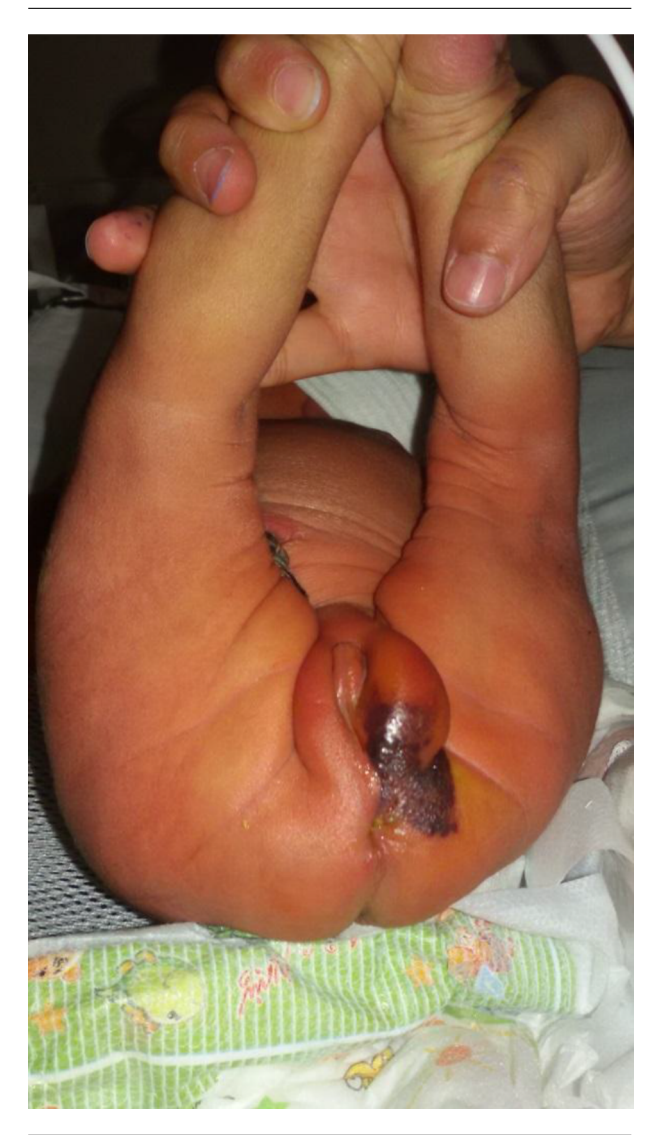
Figure 1. Skin Lesion in the First Examination

Laboratory study showed; direct hyperbilirubinemia (total bilirubin 17.6 mg/dL, direct bilirubin 5.9 mg/dL), blood cell count abnormality (WBC 2,160, neutrophil 5% lymph 88%, mono 7%, Hb 12.8 gr/dL, Plt 21,000) and elevated CRP 41.9 mg/L. TORCH study was negative. Blood and wound culture grew Pseudomonas aeruginosa sensitive to meropenem and amikacin.