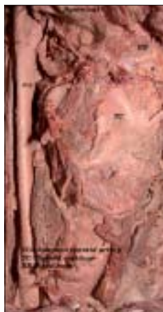
Figure 1: High bifurcation of the right common carotid artery

In the male cadaver, on the right side, the common carotid artery divided at the higher level coinciding with the level of the tip of the hyoid bone. The length of the right common carotid artery was 10.5 cm [Figure 1]. At its division, the external carotid was anterolateral and the internal carotid artery was posteromedial [Figure 2]. The occipital artery arose at the carotid bifurcation characterizing it as a trifurcation of the right common carotid artery. The ascending pharyngeal artery was