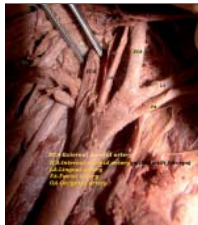
Figure 3: Branches of the right external carotid artery

The origin of the occipital artery from the carotid bifurcation has been reported by Quain, [4] Livini, [5] Gurburz et al. [6] In a large study Adachi et al. [7] studied 298 subjects