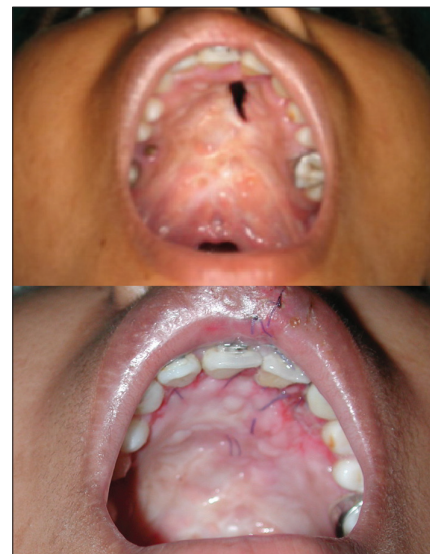
Figure 1b: Fistula repair by alveolar extended palatoplasty