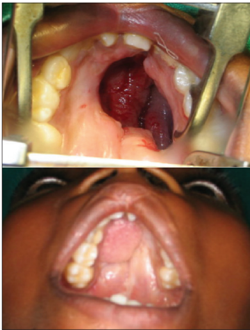
Figure 2: Tongue flap for fistulae repair

Although palatal fistula is a common morbidity after cleft