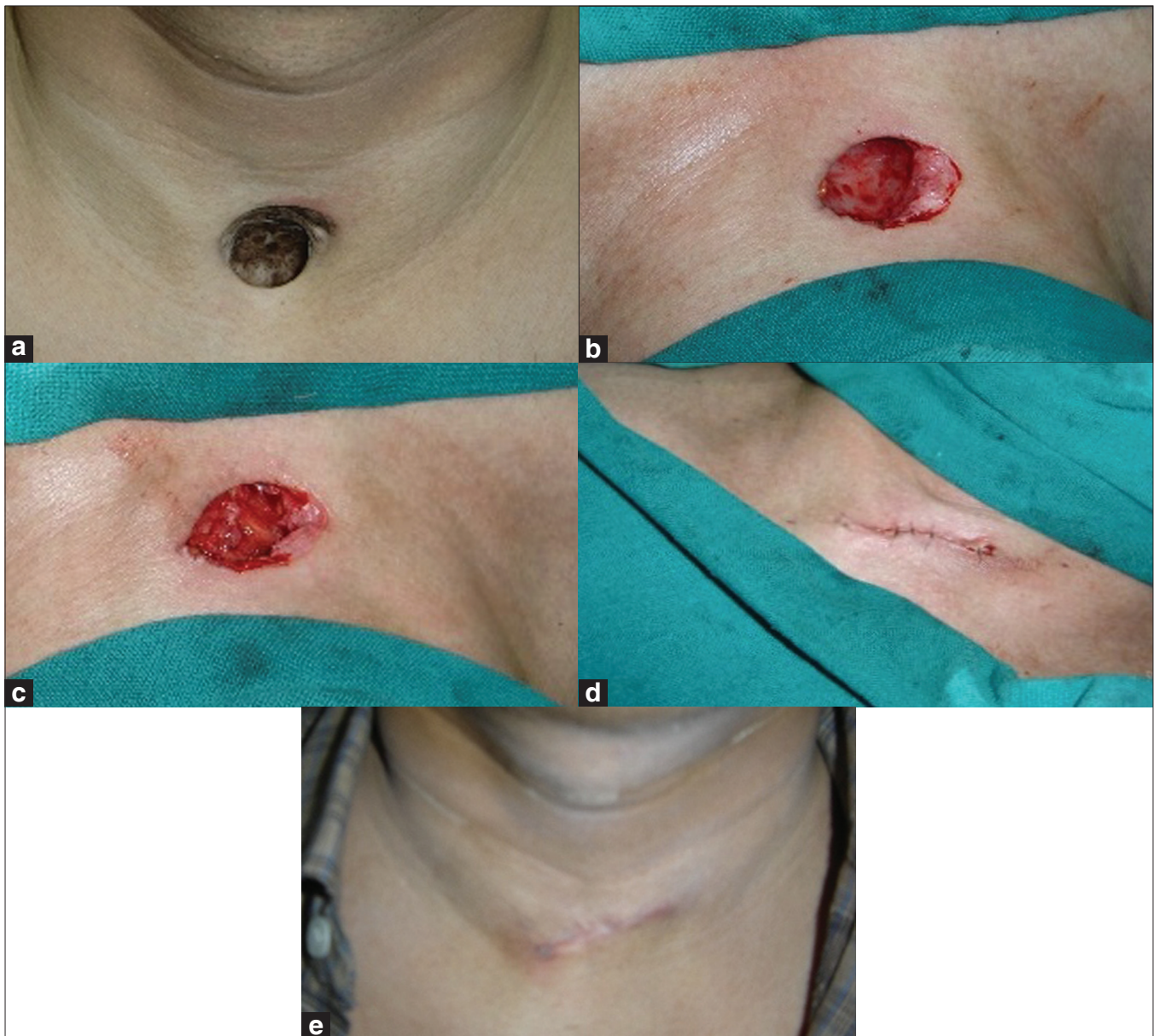
Figure 1: (a) Preoperative showing depressed scar at suprasternal notch area; (b) defect after excision of scar; (c) platysma muscle flap advanced into the defect; (d) closure of wound transversely; (e) final result

the suprasternal notch. He had an abscess in this area about 5 months back. A scar was formed after abscess drainage and healing by secondary intention. The scar was excised. Skin margins were freed. Platysma muscle was freed transversely and advanced into the defect. The wound closure was done horizontally [Figure 1 a–e].