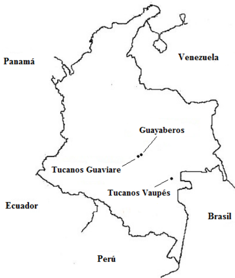
Figure 1. Map of continental Colombia with the location of the sampling sites: Mitú (Tucanos from Vaupés), El Refugio (Tucanos from Guaviare), and el Barrancón (Guayaberos from Guaviare)

net is reflected in the results presented here. On the other hand, geographical proximity is not synonymous of a common biological history. The Guaviare Eastern Tukanoans are located near the Guayaberos (~ 7 km) ever since approximately five decades ago.