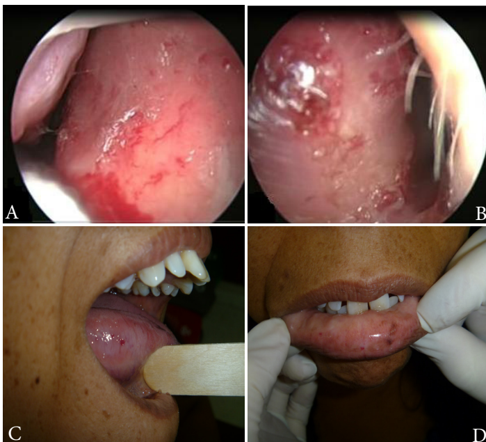
Figure 1. Rhinoscopy with zero-degree endoscopy lens showing telangiectasias on septal mucosa of the right side (A) and left side (B). Telangiectasia on the tongue (C) and lower lip (D).