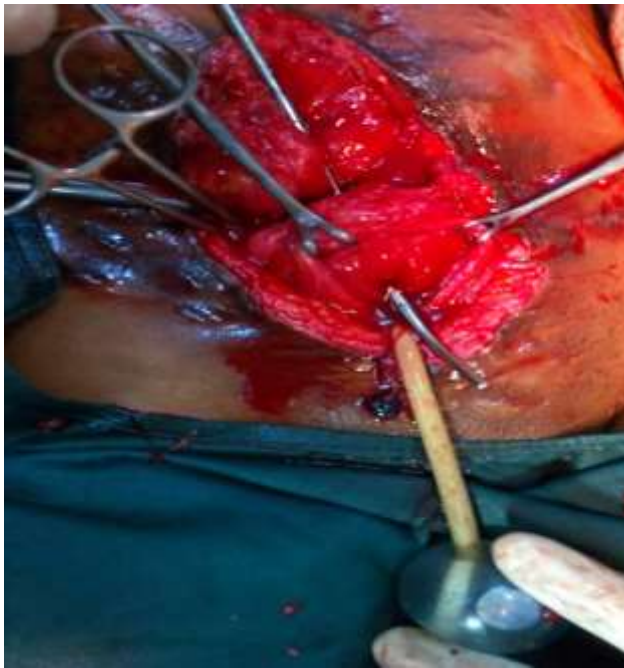
Figure 2: The bladder was opened during surgery and defect on the bladder was then identified

enterovesical fistula may be surgical or non surgical 8 . Our patient had operative management with good outcome.