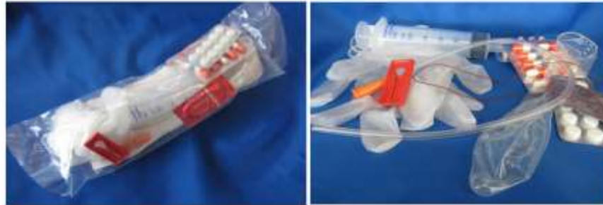
Figure 1: Intrauterine Condom Tamponade Kit and its contents