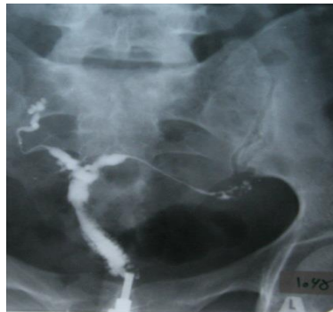
Figure 6. Small uterine cavity with irregular contour and resembling septate appearance. Diverticular outpouching around ampulla in both fallopian tubes which make tuffed appearance.