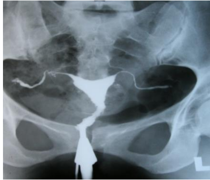
Figure 1. Case1: Uterine cavity with normal shape and size. Also there is rigid pipe stem appearance of the fallopian tubes