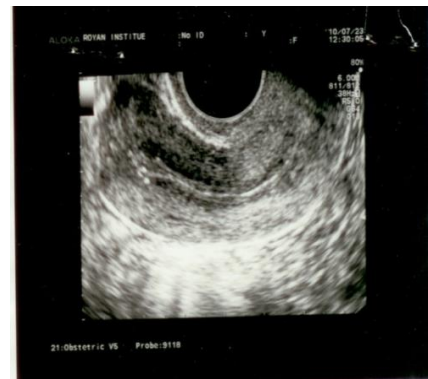
Figure 3 (A, B, C). Case 3. A) HSG 4 years ago, bilateral tubal obstruction with golf-club appearance, B) Recent HSG revealed T shaped uterus, Venous and lymphatic intravasation. C) Uterine ultrasound, tiny foci of calcification within the endometrium which shows some degree of adhesion.