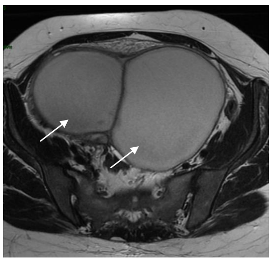
Figure 2. Pelvic abscess in a 37 years old women (Case 3).