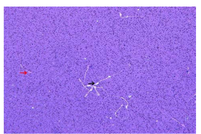
Figure 1. Illustration of live sperm ( \triangleright ) and dead sperm ( \triangleright ) in T6 plus caffeine (400 x).

The T-test was used for statistical analysis and p<0.05 were considered statistically significant.